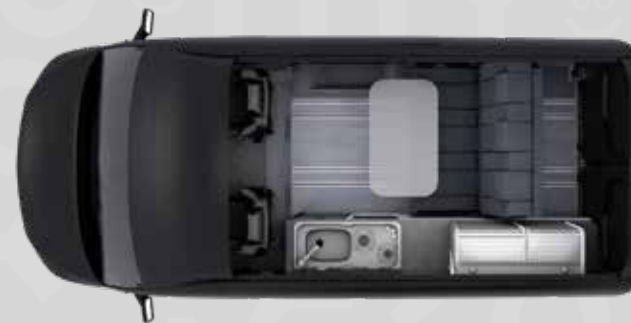
YUCON 51 FB