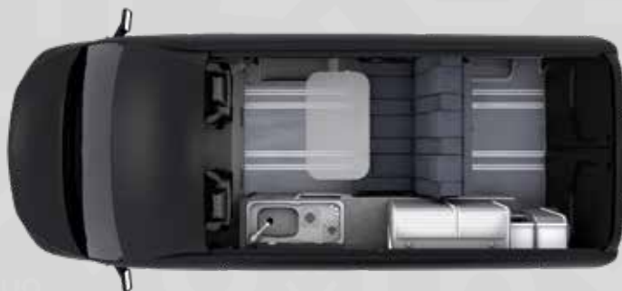
YUCON 55 SB

All information on standard equipment can be found from page 27 onwards.