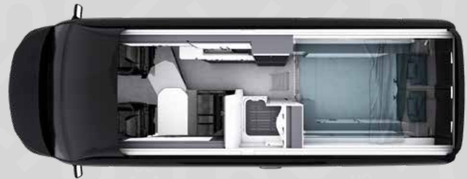
YUON 63 H

All information on standard equipment can be found from page 19 onwards.