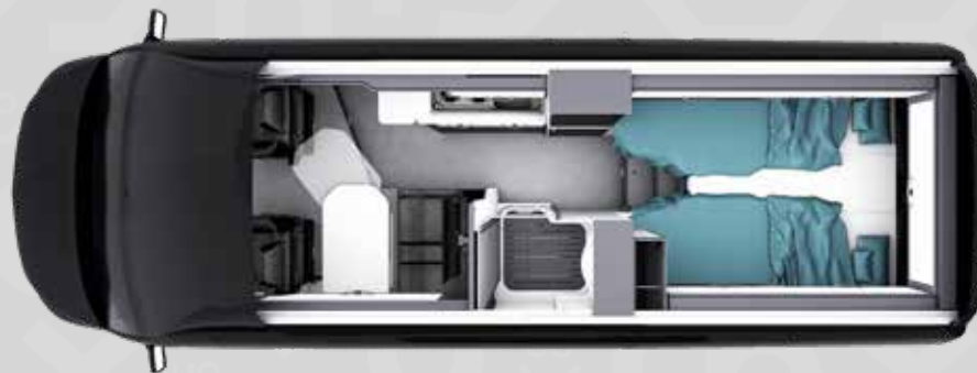
YUON 63 G