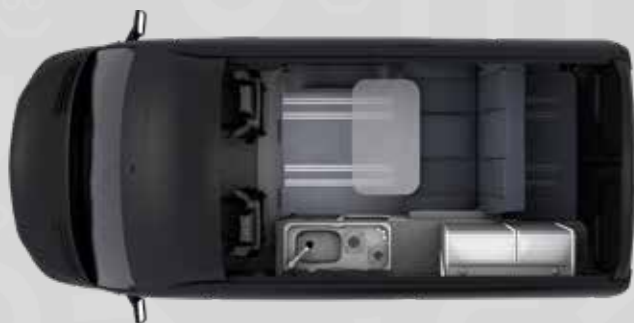
YUCON 51 SB