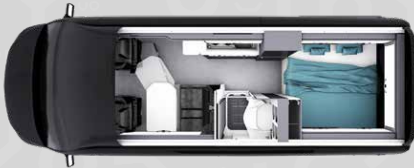
YUON 60 B